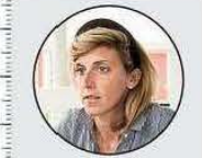
JEN ABEL @JEN_ABEL

In early days, an enterprise pilot is service-led value often extremely manual, requiring significant project management, and hand-held customization white-glove service is a big aspect of 'product' value when you move up-market